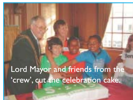
Lord Mayor and friends from the 'crew', cut the celebration cake.

Please send all your comments and suggestions about this update to the children's services unit. Email: children.leeds@leeds.gov.uk Phone: 0113 395 0247